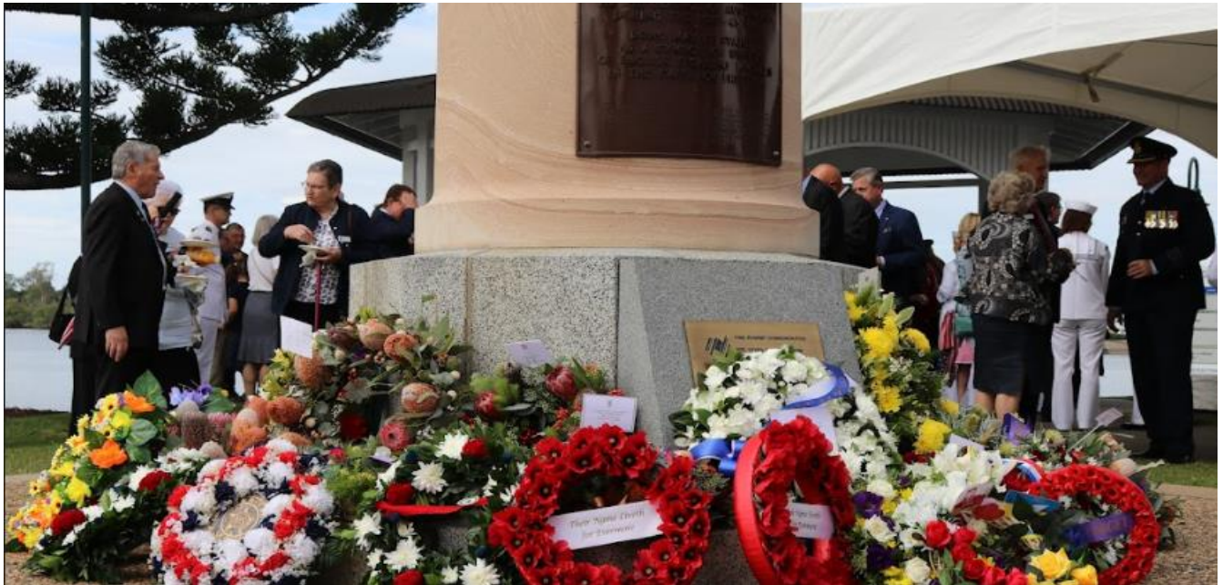
The Australian American War Memorial Cenotaph at Newstead Park, Brisbane, following the 80 th Anniversary of the Battle of the Coral Sea Wreath-laying Ceremony, is adorned with 73 beautiful wreaths. These wreaths were placed in remembrance of all of those who fought and those who died, throughout this momentous battle that saved Australia from invasion, during our darkest times of 1942.