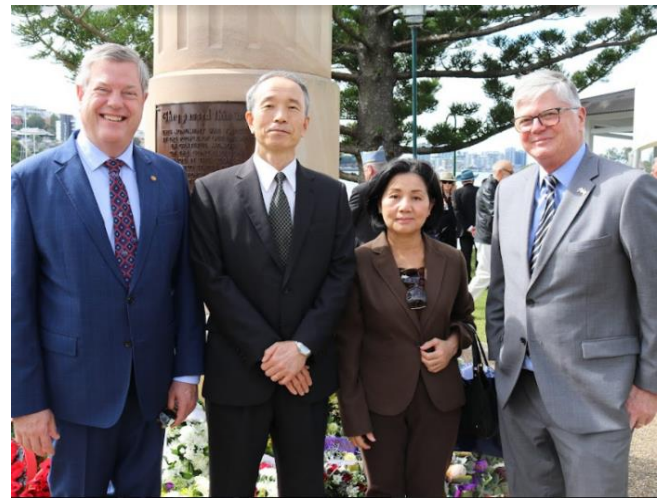
From left: The Hon. Tim Nicholls MP State Member for Clayfield, Consul General of Japan the Hon. Masuo Ono and his wife Mrs Kimu Ono, and Cr David Mc Lachlan Member for Hamilton Ward.