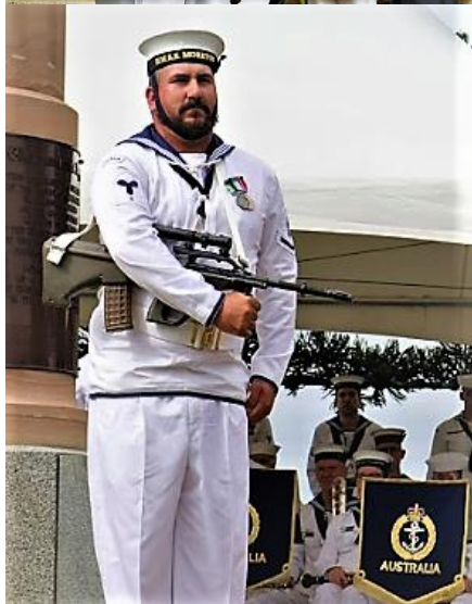
Two members of the RAN Catafalque Party at the Cenotaph.