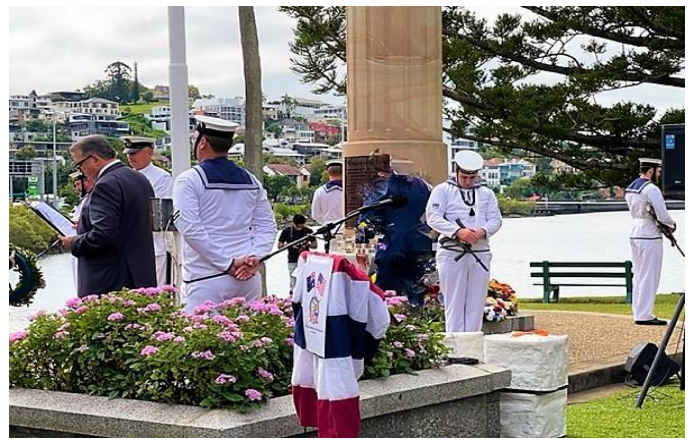
The Australian American War Memorial Cenotaph.