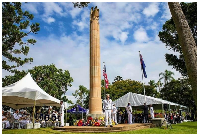
Commemoration of the 80 th Anniversary of the Battle of the Coral Sea, held at the Australian American War Memorial Cenotaph located at Newstead Park Brisbane, Queensland on Sat 7 th May 2022.