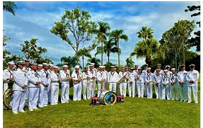
The USN 7 th Fleet Band and RAN Band Queensland, grouped together at Newstead Park prior to the event.