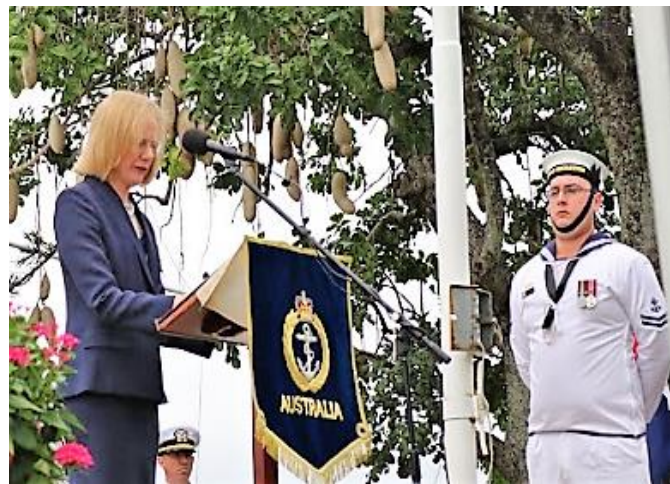
Address by the Honourable Dr Jeannette Young, Governor of Queensland.