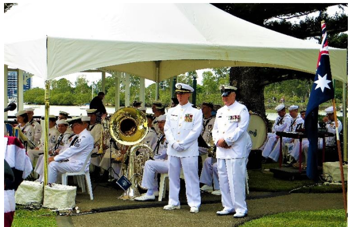
The USN 7 th Fleet Band and the RAN Band Queensland, based at HMAS Moreton, Brisbane.