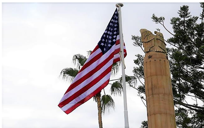
American Eagle figure surmounting the Australian American War Memorial Cenotaph at Newstead Park.