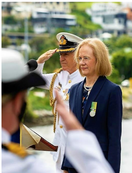
The Governor of Queensland, receiving the Salute.