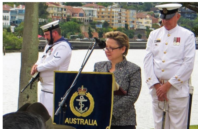
United States of America's President's Message given by the Honourable Christine Elder, Consul General of the United States of America.