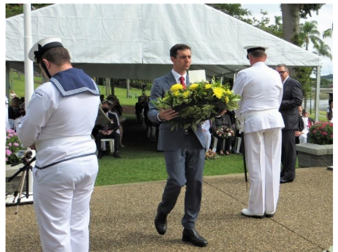
Federal Member of Brisbane Central, the Honourable Trevor Evans laying a wreath on behalf of the Prime Minister of Australia.