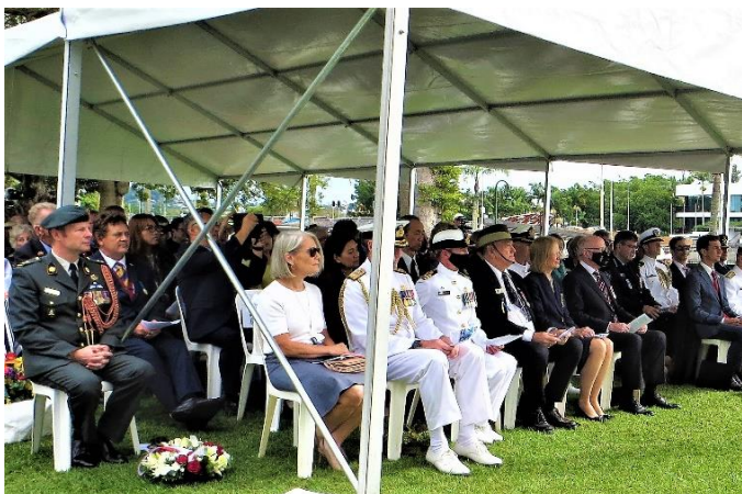
A record number of 280 guests attended the 80 th Anniversary of the Battle of the Coral Sea Service.